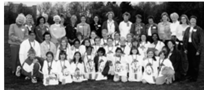
Colloquium participants team up with members of Girls Inc. in support of Team Athena at the Women's Little 500.

What better way to support the Girls Inc. motto—“Inspiring Girls to be Strong, Smart, and Bold”—than to enable its members to share in and celebrate the strength and determination of IU's women riders.