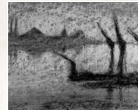
A gift of Chancellor Herman B Wells to the IU Art Museum: James McNeil Whistler's Chelsea Reach , pastel on paper, c. 1875

A new exhibit at the IU Art Museum, “The Legacy of Herman B Wells: Living with Art,” opens the weekend of the Colloquium. The opening reception is Friday, October 5th, and attendees will have the opportunity to visit the museum during breaks in the schedule on Saturday. On display will be Wells' personal collection of paintings, sculpture, and antique furniture, as well as a number of works Wells gave to the museum and to IU over the years.